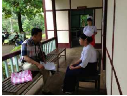
Joint Malaria Surveillance Evaluation conducted by FETP Thailand and FETP Myanmar, 2014