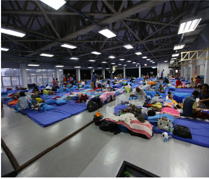
Setting up event-based surveillance systems in temporary shelters during the 2011 Severe Flood in Thailand