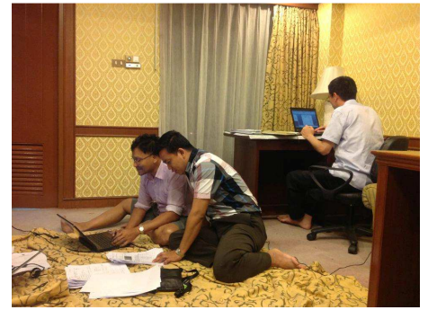
Data analysis and prepared presentation for provincial